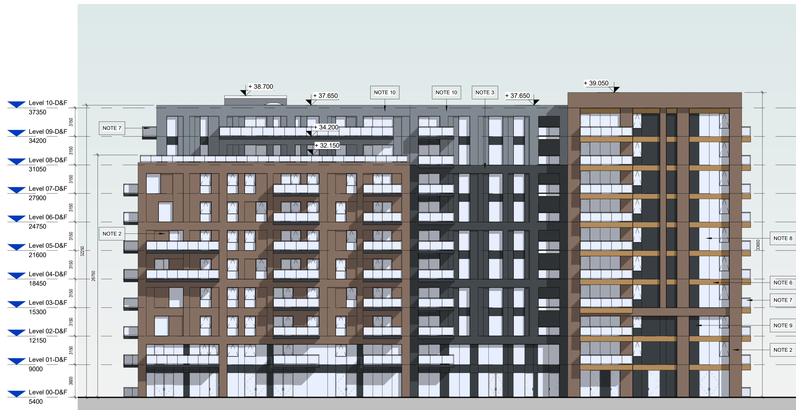
1 BLOCK F-NORTH ELEVATION 1 : 200